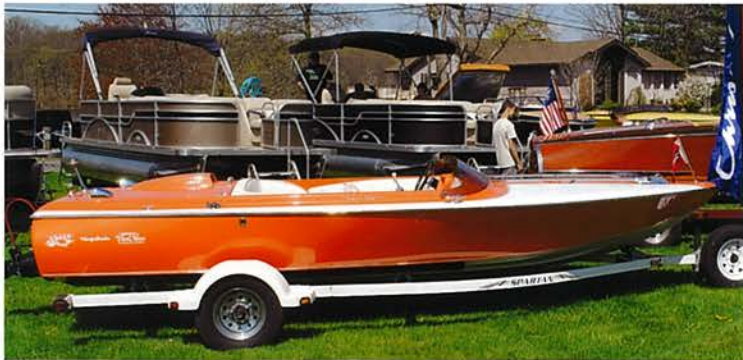
Pumpkin 1972 Chris Craft XK 18 454 Engine 500 hp