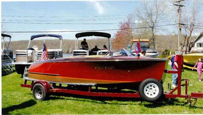
Evaline 1940 17' Chris Craft Deluxe Runabout KB Engine 121 hp

Several area marinas collaborated to conduct a boat show by the Lake Forest Yacht Club on May 2-3. Most of the boats were new, but captivating to your editor were the three generations of Chris Crafts displayed by Katz's Marina. The three boats span seventy-five years of Chris Craft production.