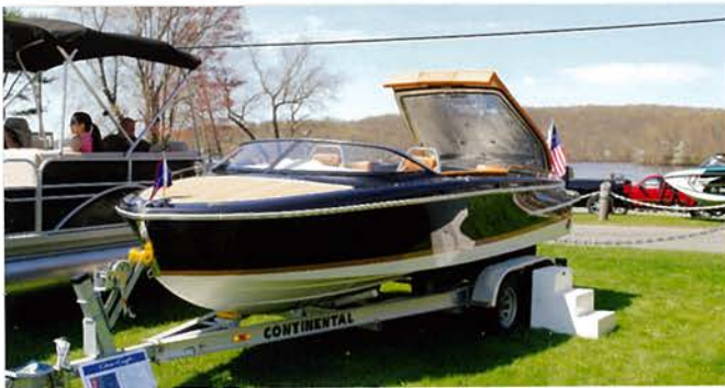
2015 Chris Craft 21 Capri LS2 Engine 400 hp