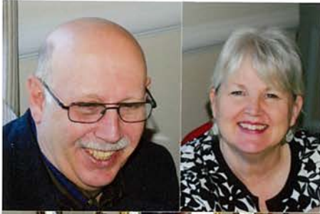
More Shots of Members Enjoying the Kick Off Meeting